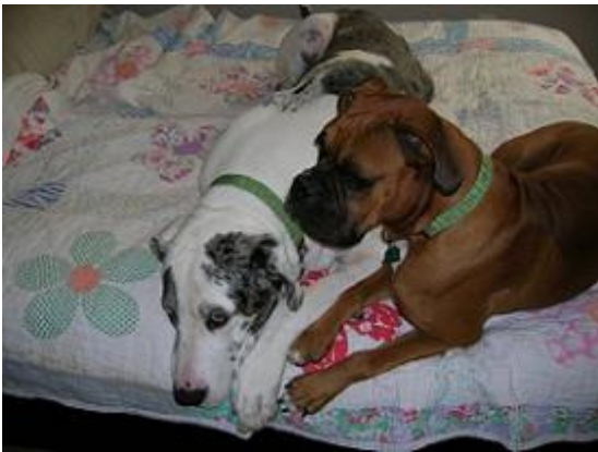
Left: Domino, Right: Duke

A big "Happy Birthday" to my Great Dane, Domino who turned 6 years old this Christmas (2009) and to my Boxer, Duke, who turned 4 years old on December 20, 2009.